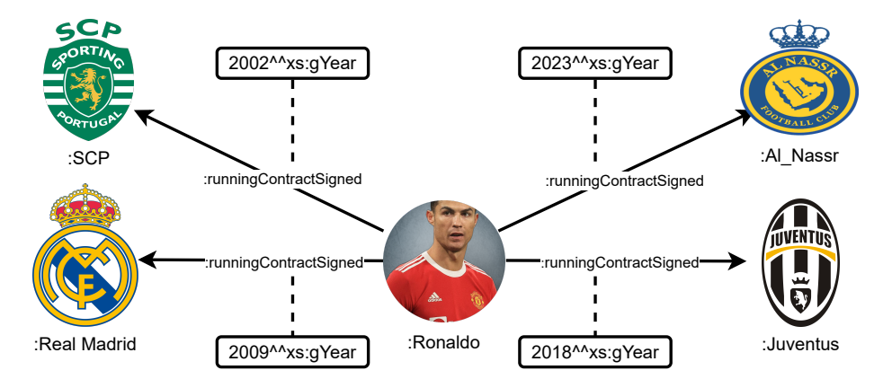
Fig. 1: A temporal knowledge graph excerpt from a large knowledge graph. The dotted line shows the time point for a given fact (in granularity of a year). Filled black lines are edges (aka predicates) with labels, and the rest are nodes of different RDF classes, which include Person, City, County, Award, and University.

Linked Open Data Stats<sup>3</sup>, which already holds over 9,000 KGs with more than 149 billion assertions and 3 billion entities, further supports the growing adoption of the Resource Description Framework (RDF) at Web scale [13]. WikiData [34], DBpedia [2], Knowledge Vault [11], and YAGO [49] are examples of large-scale KGs that include billions of assertions and describe millions of entities. They are used as background information in an increasing number of applications, such as in-flight entertainment [35], autonomous chatbots [1], and healthcare [27]. However, current KGs may not be fully correct. for instance, the literature assumes that roughly 20% of DBpedia's claims are erroneous [19,44]. To encourage the further adoption of KGs on a large scale on the Web, approaches that can automatically forecast the truthfulness of the assertions included in KGs must be developed. Such methods are what we refer to as fact-checking approaches.